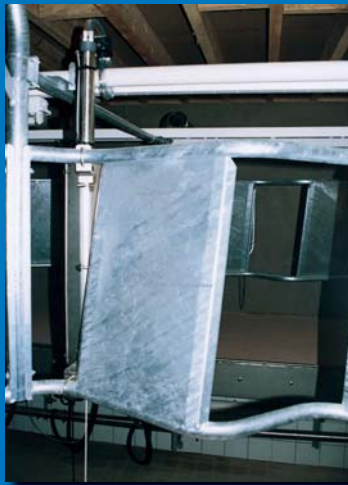
F ixed and adjustable brisket rail.

I ndexable brisket rail: by swinging it out of the way along the wall, cows leave faster and more easily.